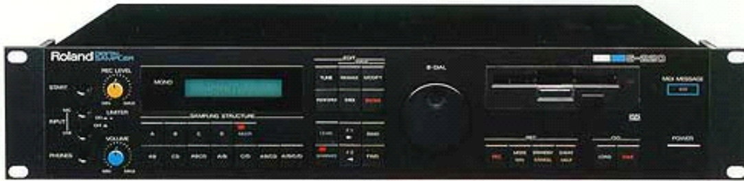
Roland S220 (My second sampler. Used it a lot for short voice samples. A real step up from the S612)