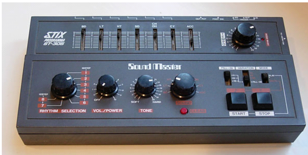
STIX ST-305 (My first drum machine. Sounded quite crap and was later replaced by the TR-707)