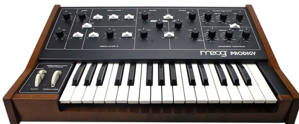
Moog Prodigy (I modified it with CV and Trigger to be able to use it with sequencer.)