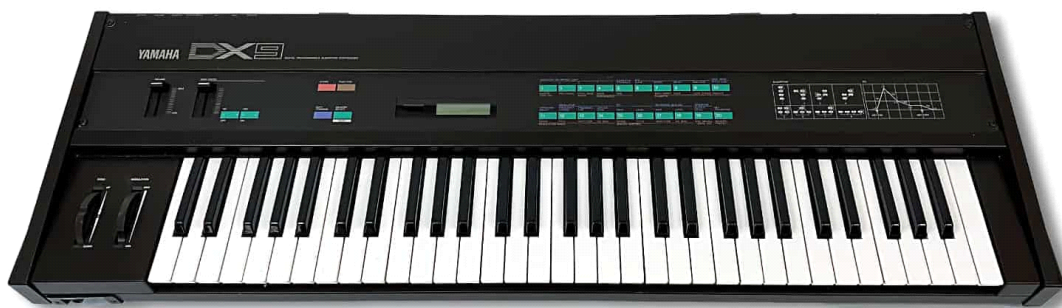
Yamaha DX-9 (Well.. everyone was into DX at the time. It actually stayed with me for quite some time. A bit too long think..)