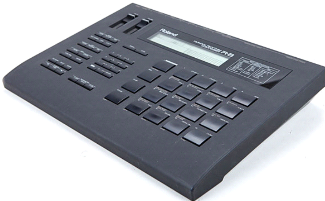
Roland R8 (My main source for drums for many years. I loved this. Very versatile and powerful.)