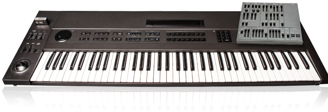
Roland JX-10 (This was quite nice although not amazing. Luckily I had the programmer too, otherwise editing was tiresome.)