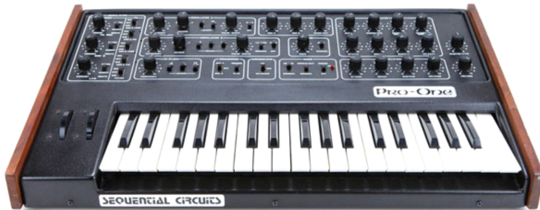
SCI Pro One (No comment needed. A classic.)