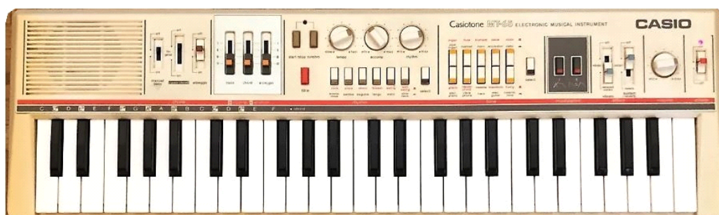
CASIO MT-65 (later replaced by the Moog from a guy who wanted the Casio and gave me the Moog as a trade.. that was a good deal for me. And the Moog stayed with me for a very long time.)