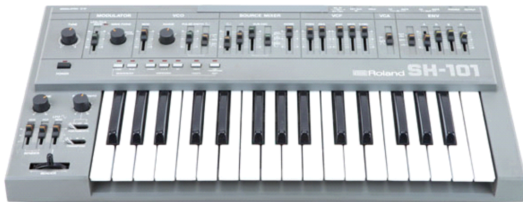
Roland SH-101 (A real workhorse. Bought it new when it was released and had it for a long time)