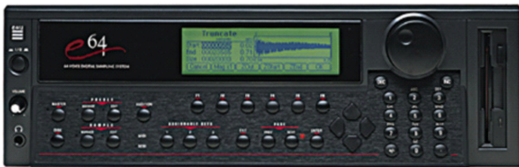
EMU E64 (My last hardware sampler which also had a External SCSI Zip drive attached to it. This was a really capably machine which I used for all sort of things )