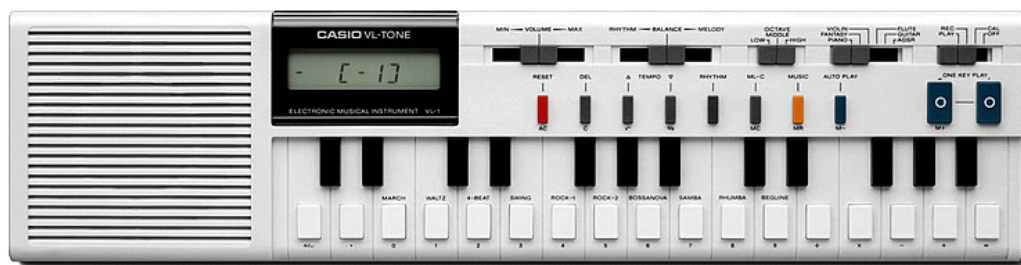
CASIO VL-TONE, VL-1 (the only one I have kept for nostalgic reasons)