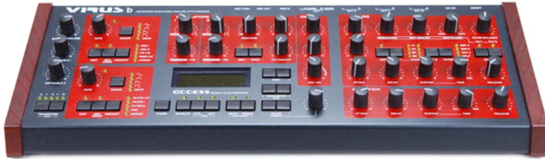
Access Virus b (One of my all time favorites. Amazing sound.)