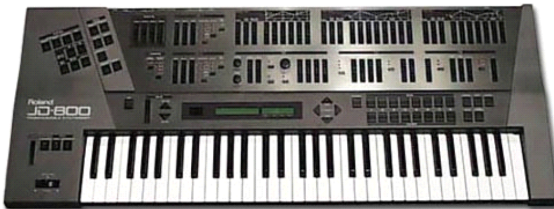
Roland JD-800 (I liked this. Knobs and sliders, and a powerful sound. The last full size polysynth that I owned).