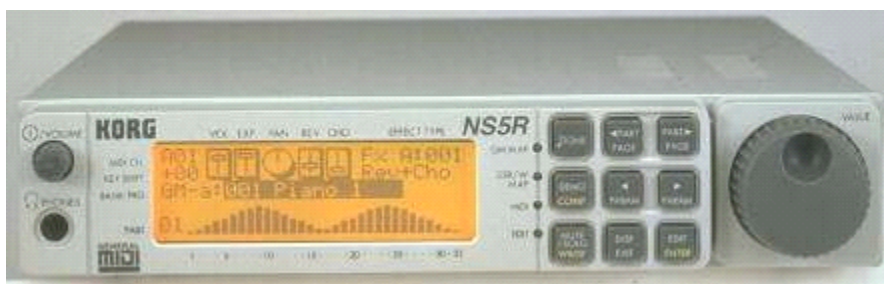
Korg NS5R (Used it for a number of years. Some typical Korg sounds of that era.)