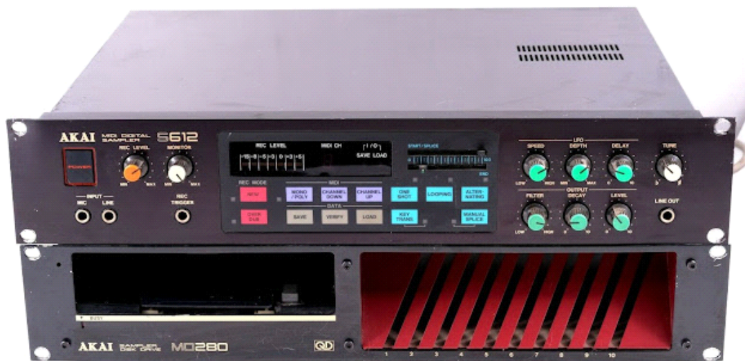
Akai S612 (My first sampler. Very limited but cool with knobs and sliders affecting the sound. And I did have the MD280 as well which was not a wonder of reliability.